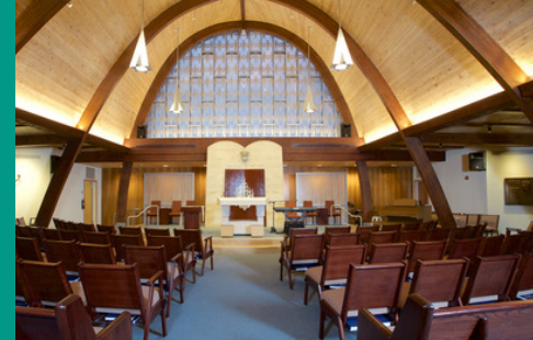
Temple Tikvah Sanctuary

In late January, Temple Tikvah hosted us for a Kabbalat Shabbat service that was lovely, warm, and inviting. The TBE members who attended felt welcome and comfortable. If you would like to get a feel for what services are like at Temple Tikvah, you can visit their YouTube page , where their shabbat services are streamed and archived.